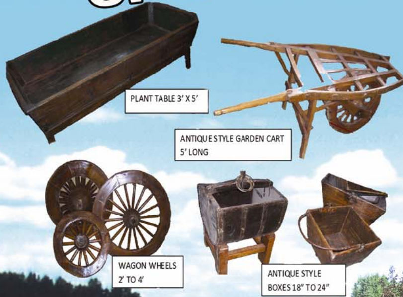
PLANT TABLE 3' X 5'