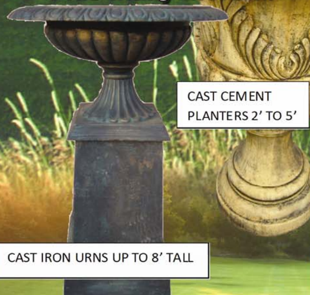
CAST CEMENT PLANTERS 2' TO 5'